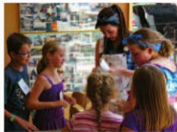
Scavenger hunt at the Seidemann Family Reunion.

Create a jigsaw puzzle from a blown-up family photo and time teens to see who can get it back together fastest.